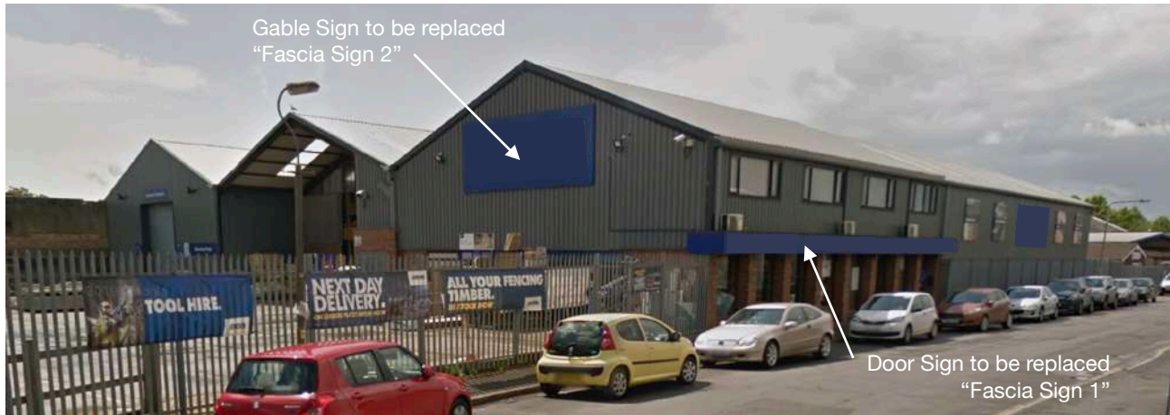
(Above) Previous occupant's fascia signage in place - image from Streetview on Google Maps

(Previous occupant's signage, to be replaced)